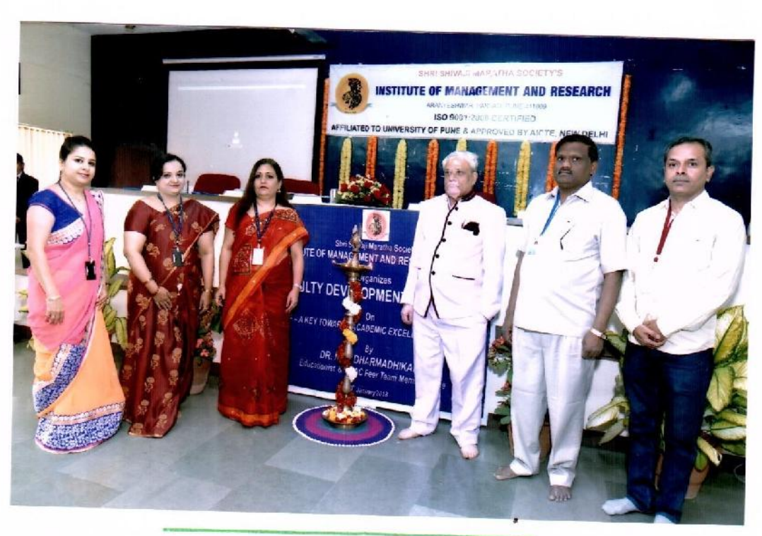
LIGTENING OF RAMP